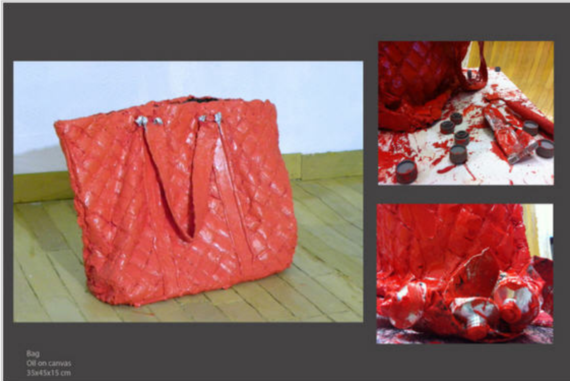
Bag Oil on canvas 35x45x15 cm