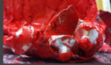
Bag Oil on canvas 35x45x15 cm